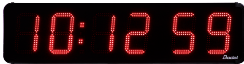
HMS: Hour - Minute - Second