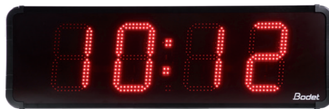
HMT: Hour - Minute - Date - Temperature